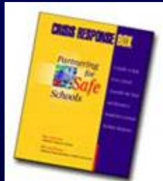
Crisis Response Box

“We found that organizing a box . . . that contains crucial information we would need to respond to a critical incident was a great way for both the schools and the police to think through how they would work together in an actual crisis. The principal, local police and local fire department have the same kit. Every summer we meet and review the contents and update them.”